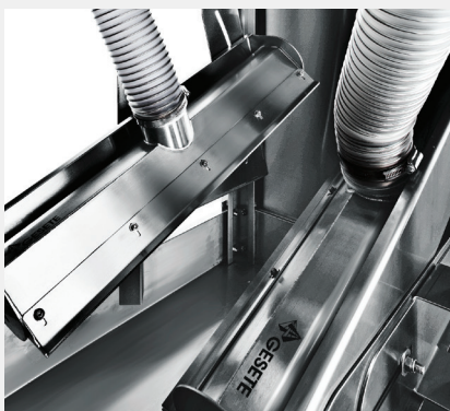
High quality stainless steel construction throughout.