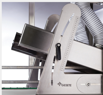
Integrated mounting and adjustment system for quick and accurate positioning of the air knives.